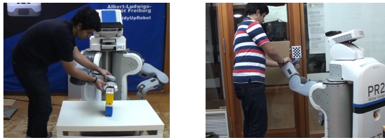
Figure 1: Examples of kinesthetic training showing how to place a block on another one and how to operate a handle.

for demonstrating individual actions one by one and does not require demonstrating sequences of actions.